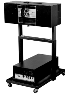
Printing Lamps see page 16

LOADS GLASS DOWN and ROTATES 360° THREE PRINTING POSITIONS