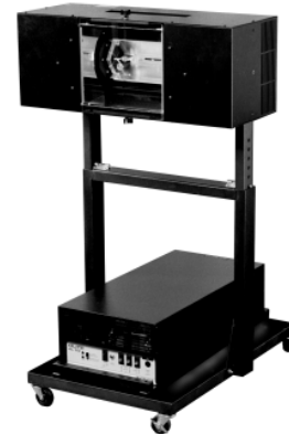
Printing Lamps see page 16